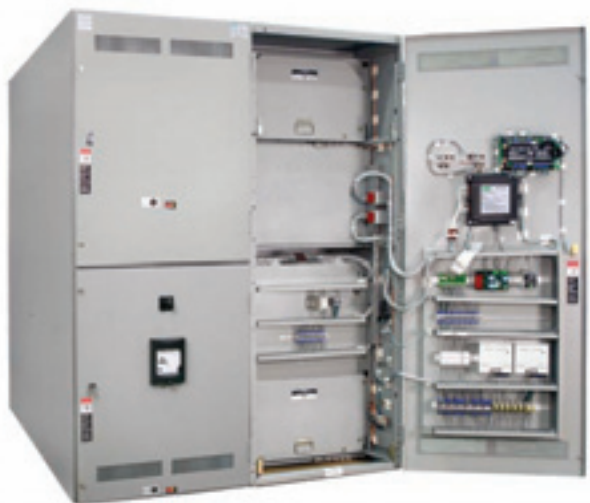
Series 977 Medium Voltage Power Transfer System, two-section enclosure with right door open

The ASCO Series 977 Medium Voltage Automatic Transfer System provides high reliability and ease of maintenance. This model complies with requirements of the: