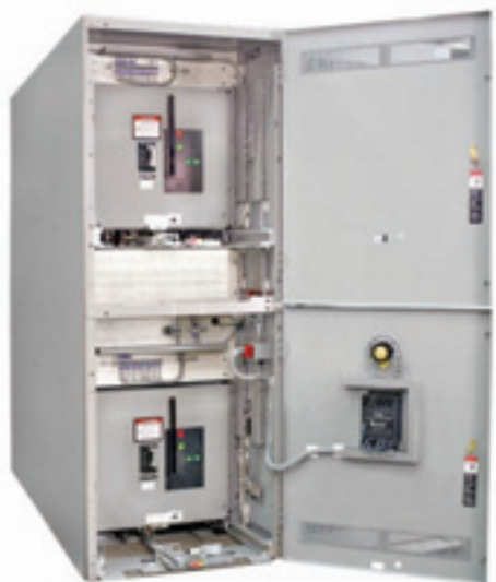
Series 977 Medium Voltage Power Transfer System, single section