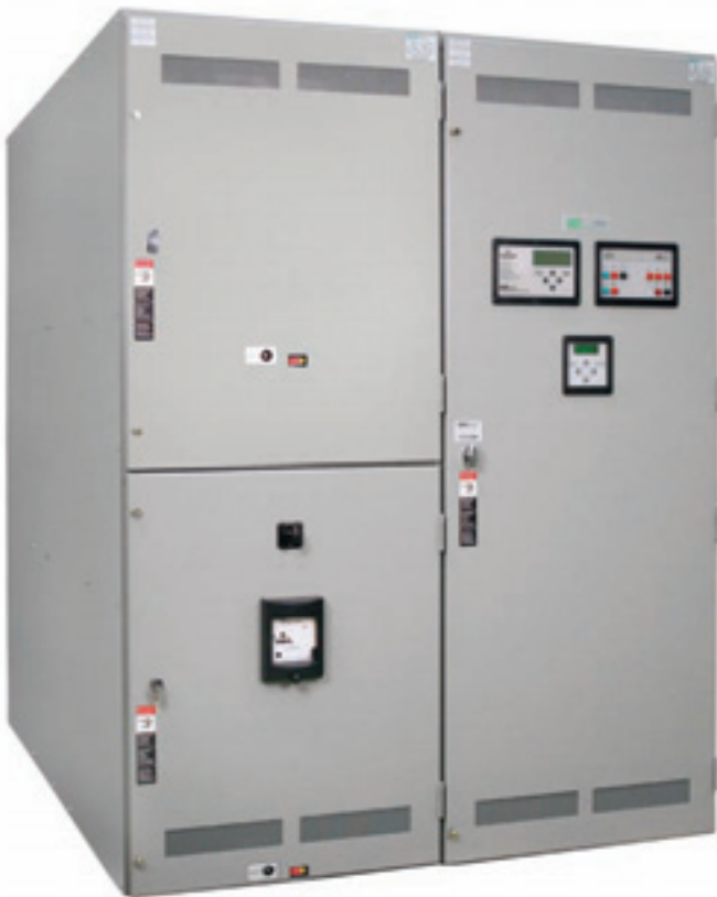
ASCO Series 977 Medium Voltage Power Transfer System

While ASCO Medium Voltage Power Transfer Switches are functionally similar to low voltage transfer switches, they use a pair of medium voltage circuit breakers rather than an ASCO solenoid operating mechanism. An ASCO 7000 Series Power Control Center manages the breaker operation to transfer critical loads between power sources.