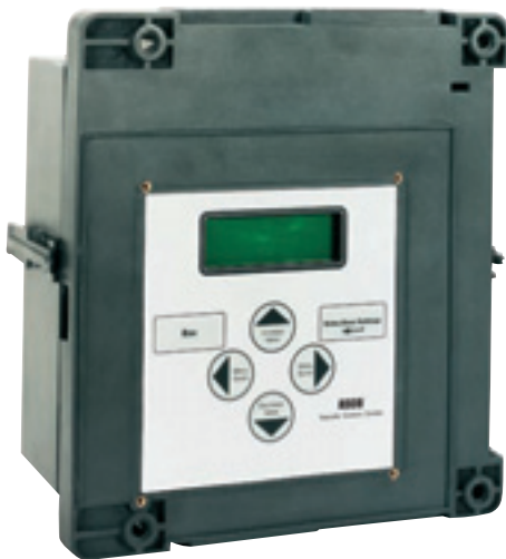
ASCO 7000 Series Microprocessor Controller

ASCO 7000 Series Medium Voltage Power Transfer Switches use the proven, microprocessor-based Power Control Center to manage circuit breakers. Designed specifically for this purpose, it contains timers and control logic that protect your loads.