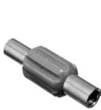
15 3-in. Can Wrench