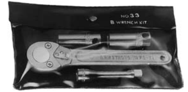
33 Socket Wrench Kit