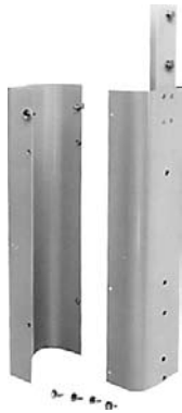
EXT6KIT & EXT8KIT