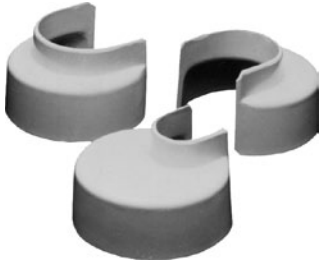
UGC2, 3, 4