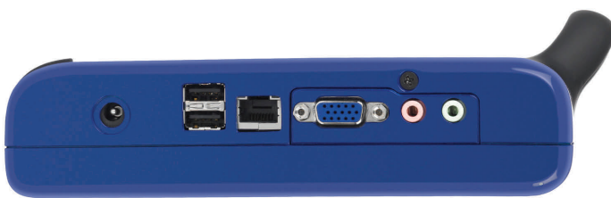
Side view showing connectivity