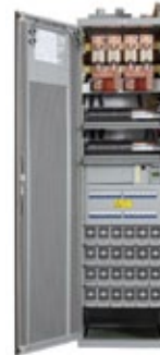
NetSure 701 Asia Pacific -48 VDC up to 154kW up to 3200A