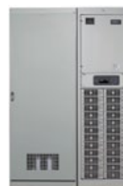
NetSure 801 North America -48 VDC up to 960kW up to 20000A