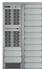
NetSure 801 EMEA -48 VDC 3-phase input up to 700kW up to 14500A