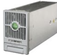
eSure R48-3200e – side view

NetSure rectifiers are globally renowned, with over 1.25 million units deployed and an unmatched reliability of less than 0.5% failure rate (200 years MTBF).