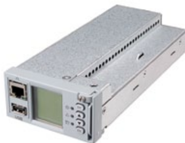
ACU+ 1x2U – side view