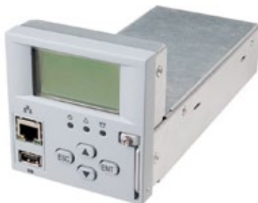
ACU+ 2x2U – side view