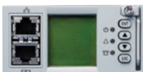
SCU+ – front view