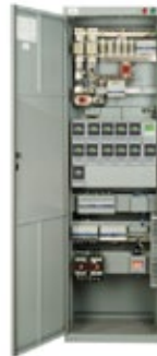
NetSure 701 China -48 VDC up to 35kW up to 720A