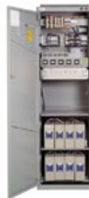
NetSure 501 China -48 VDC up to 8.5kW up to 180A