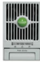
eSure R48-3200e – front view