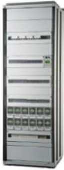
NetSure 701 EMEA -48 VDC up to 384kW up to 8000A

These systems display the flexibility for one family within the NetSure DC Power technology platform to be custom-configured for various applications within the data- and telecommunications-network infrastructure.