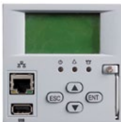
ACU+ 2x2U – front view