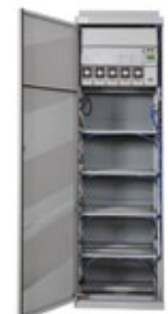
NetSure 700 EMEA & Asia Pacific +24 VDC up to 11kW up to 230A