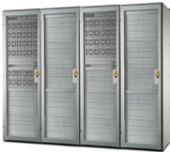
NetSure 701 EMEA Bulk system -48 VDC up to 384kW up to 8000A